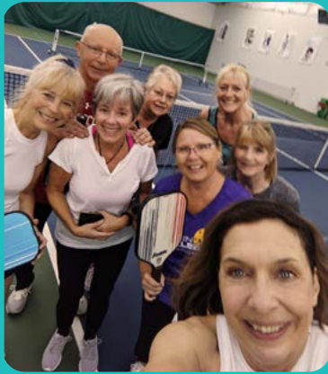
A group of Oshkosh Y Pickleball players that have been playing together for over 5 years! Strangers, turned pickleball partners, turned lifelong friends!